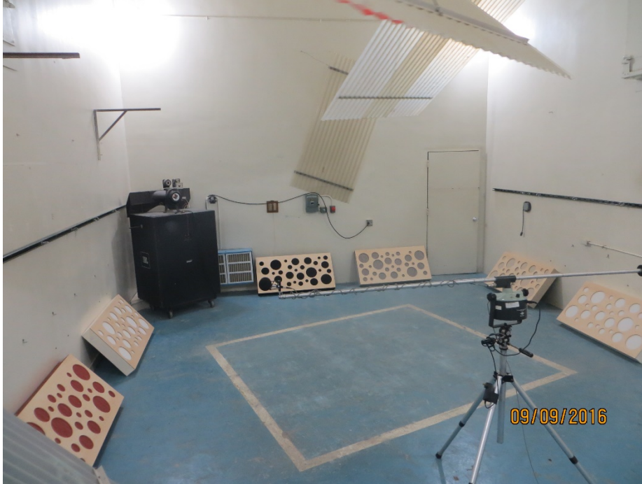
Figure 1 - Specimen mounted in the test chamber.