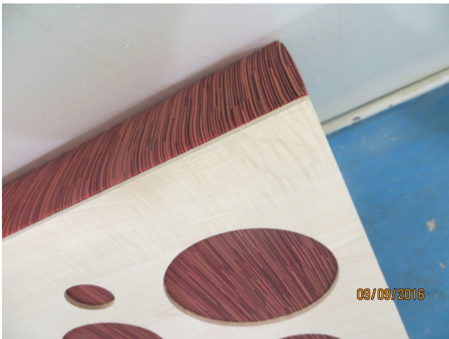
Figure 2 - Detail of the test specimen.